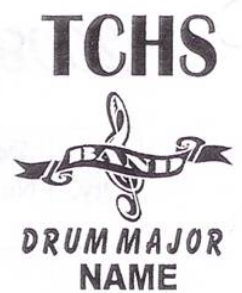
Drum Major Band-05