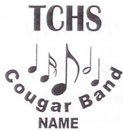
ALL Bands Band-01